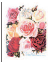
Cover from a seed catalog