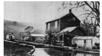
Lock 7 West near New Village. The store at the far end of the lock sold goods to boatmen including homemade pies & bread. It was known for many years as "Gardner's" Lock and also as "Fresh Bread" Lock. The sign on the store reads "Homemade Potato Bread."

The Learning Center is a small museum located at the site of Morris Canal Lock 7 West (The Bread Lock). Visitors will be able to see the remains of the lock, see models and displays of the Morris Canal and other aspects of Warren County history including the Shippen Manor, Oxford Furnace, charcoal making and Lenni-Lenape culture and the Easton-Washington Traction Company trolley line.