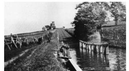
Plane 9 West, the longest and highest plane on the Morris Canal, was 510 feet long to its summit and 1,788 feet long from end to end. It was one of three planes with a double set of tracks.

This small museum is located at the site of the Morris Canal Plane 9 West, the longest of the inclined planes. This site is the former home of the late James S. Lee, Sr., Morris Canal author and historian. Visitors will be able to walk the incline plane, tour the remains of the powerhouse, tailrace, turbine chamber as well as the museum.