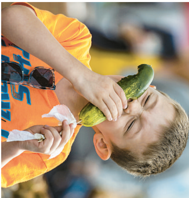
May 3 is the opening day for Easton Farmer Market's regular season. The market is the nation's oldest continuously running, open-air farmers market in the county.

Activities and special events include: The Little Turn to Markets, Page 13